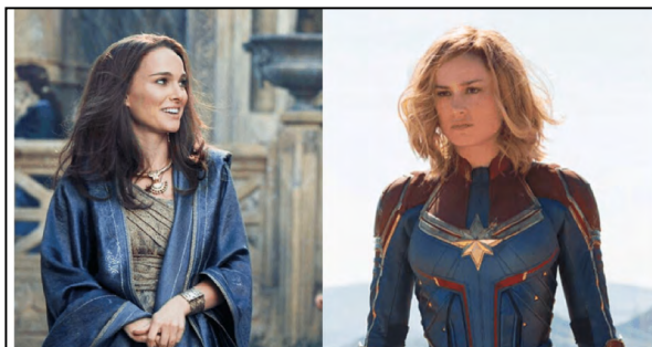
Report: Thor Actor Natalie Portman and Captain Marvel's Brie Larson Sign Open Letter To Defund Police Departments